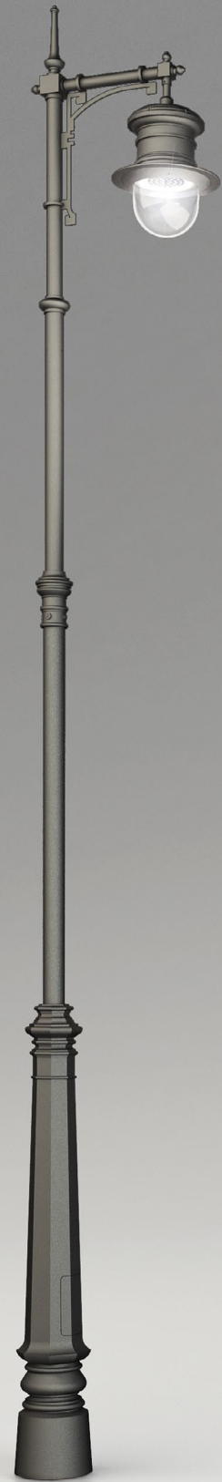
Luminaire Modern Nara