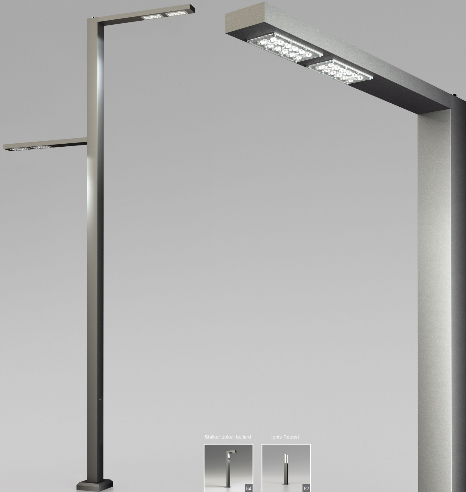
Stalker Joker bollard